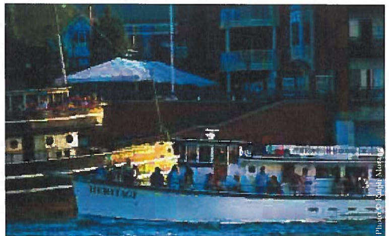
LEARNING ABOUT PORTSMOUTH'S MARITIME HISTORY WHILE CRUISING THE PISCATAQUA RIVER ON "The Heritage" TOUR BOAT