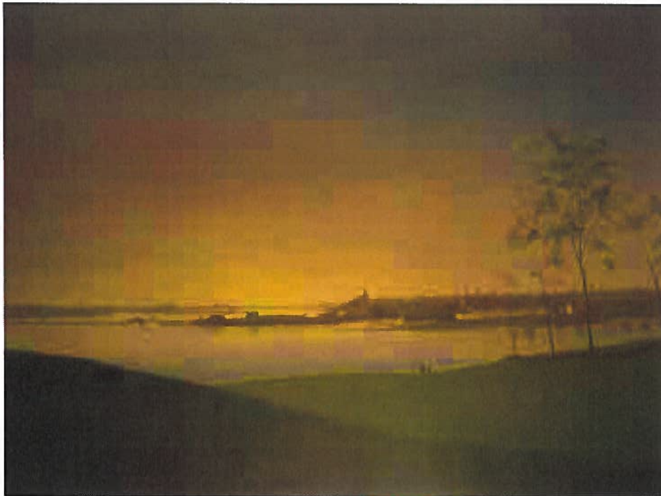
VIEW OF PORTSMOUTH FROM FREEMAN'S POINT, CURRENTLY HANGING IN PORTSMOUTH CITY HALL. PAINTED BY JOHN S. BLUNT, 1830

The Mayor's Blue Ribbon Committee on Arts and Culture December 2001